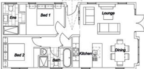
TAMARACK LODGE 40 x 20 ft